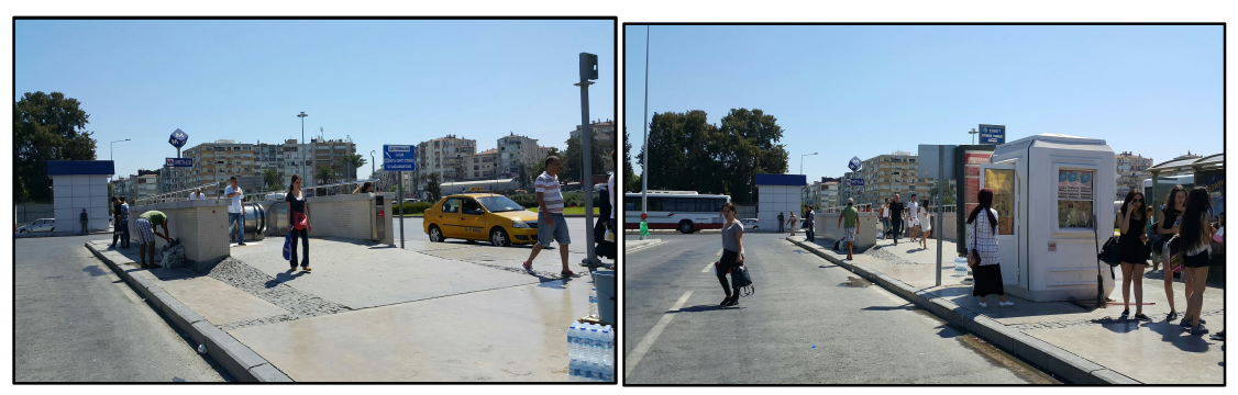
Figure 3: a.b. Entrance for Subway and Bus Stops

Majority of respondents also emphasized that although they need to use public transportation tools to engage in economic and related activities for their lives, they usually hesitate to use them in order to protect themselves from any types of criminal activity. The data also revealed that younger women aged 17 to 38, (who are mostly students or workers), were more likely to be harassed than elder women. The main reasons for that, in addition to their usage for public transportation frequently and more often, elder women are more fearful to use these transportation tools because of safety and security issues, thus they mostly travel for limited and certain times which make them feel relatively safer.