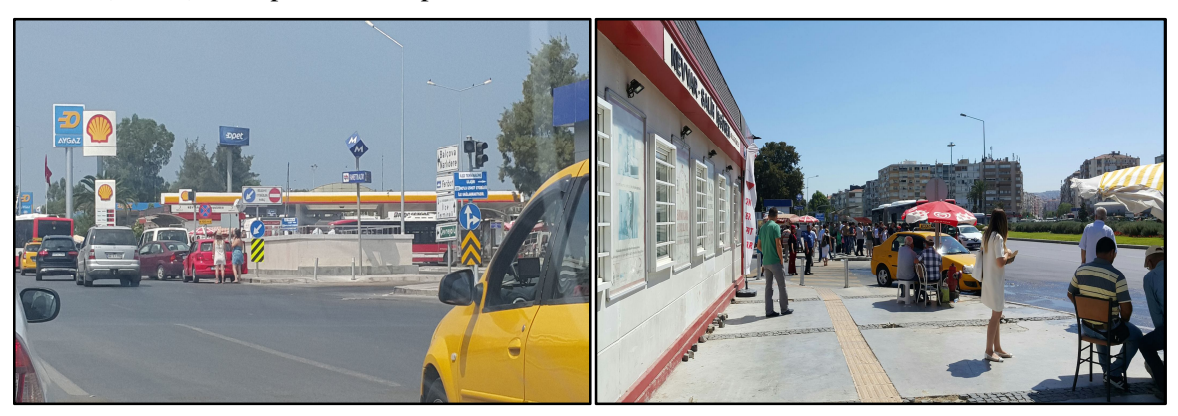
Figure 2: a.b. The general views from public transportation hub

The survey consisted of three sections included questions on passengers' demographic de-tails, travel preferences and frequency, perceived safety and accessibility items, as well as their past experiences related to women safety. Through the research period, the responses gathered were based not only on women's perceptions of safety and danger while they are in and around public transportation tools, but also on real-life experiences. The data collected in the research process were analyzed under the several main topics. According to the 100 survey respondents in İzmir who said that they had experienced some form of criminal act (46%) that made them feel uncomfortable, (37.2%) of respondents' experienced anti-social behavior or sexual harassment almost weekly.