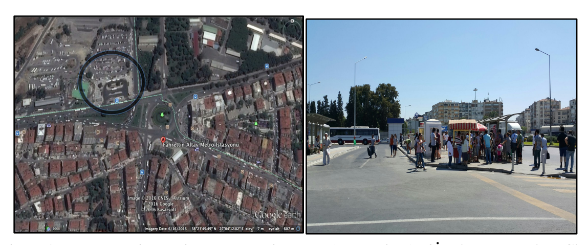
Figure 1: a.b. The main public transportation hubs (subway/bus) of İzmir Metropolitan City

Data collection and observations went on for two days, between 8.00 am and 22.00 pm approximately. The 100 participants were asked to complete a questionnaire while waiting for the public transportation tools (bus and/or subway), coming from the (bus and/or subway), or sitting on the (bus and/or subway). As this was the first approach to studying links between perceived safety occurring at different stages of travel (before, during, arrival), this initial data collection involved only public transportation travelers. The participants were aged between 17 and 72; the majority was on their way to home or from work, school or social activities.